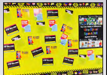
Bulletin Board in Mattlin about "Step Up and Speak Out" against Bullying.